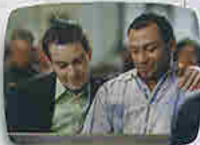
■ Gays go flying in a new UCC television ad.

Broadcast TV networks, however, have no trouble with rejection, and ABC, CBS, NBC, and Fox have refused to air the United Church of Christ's latest pro-inclusion promo. "CBS essentially